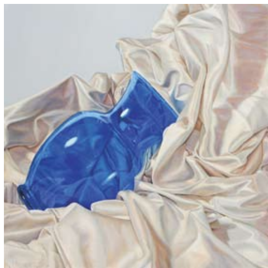
BLUE VASE, OIL, 30 X 30"