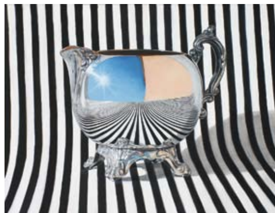
BLUE SKIES, OIL, 18 X 24"