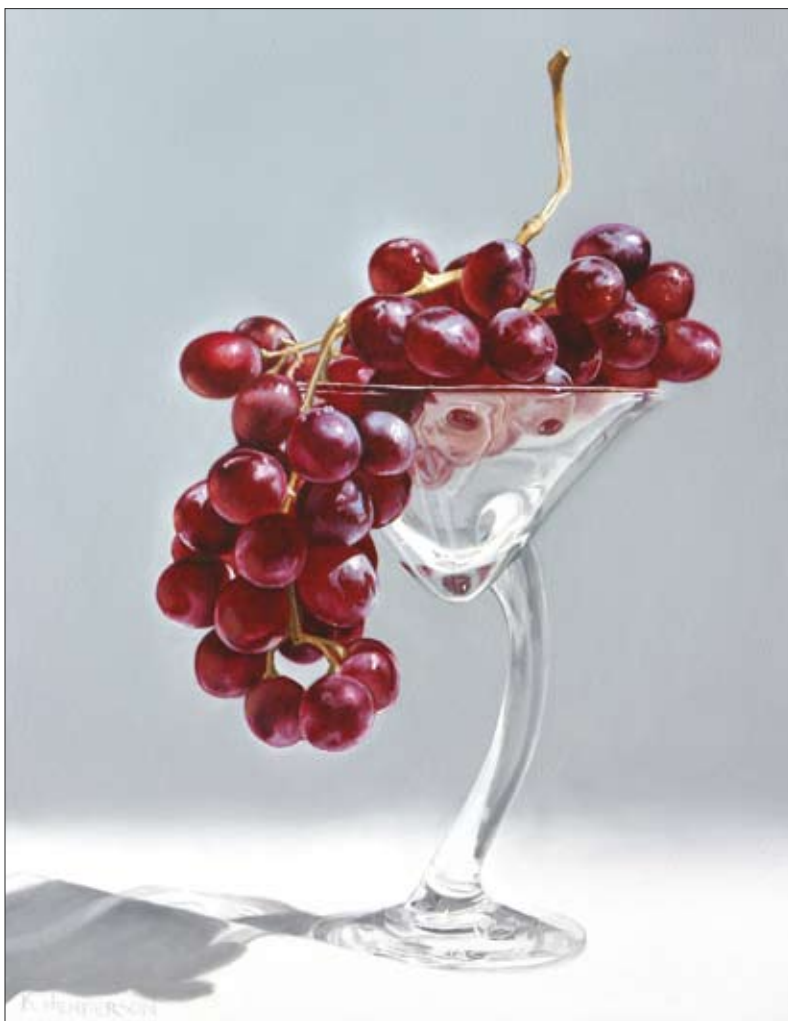
GRAPES, OIL, 14 X 11"